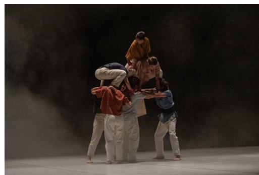
"Renfilats" TANZtheater INTERNATIONAL Festival Hannover – Staatsoper Hannover